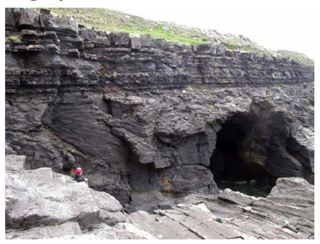
Upper Carboniferous strata at Fisherstreet

A limestone landscape at Mullaghmore in the Burren. Limestone has been gently folded during the Variscan mountainbuilding episode