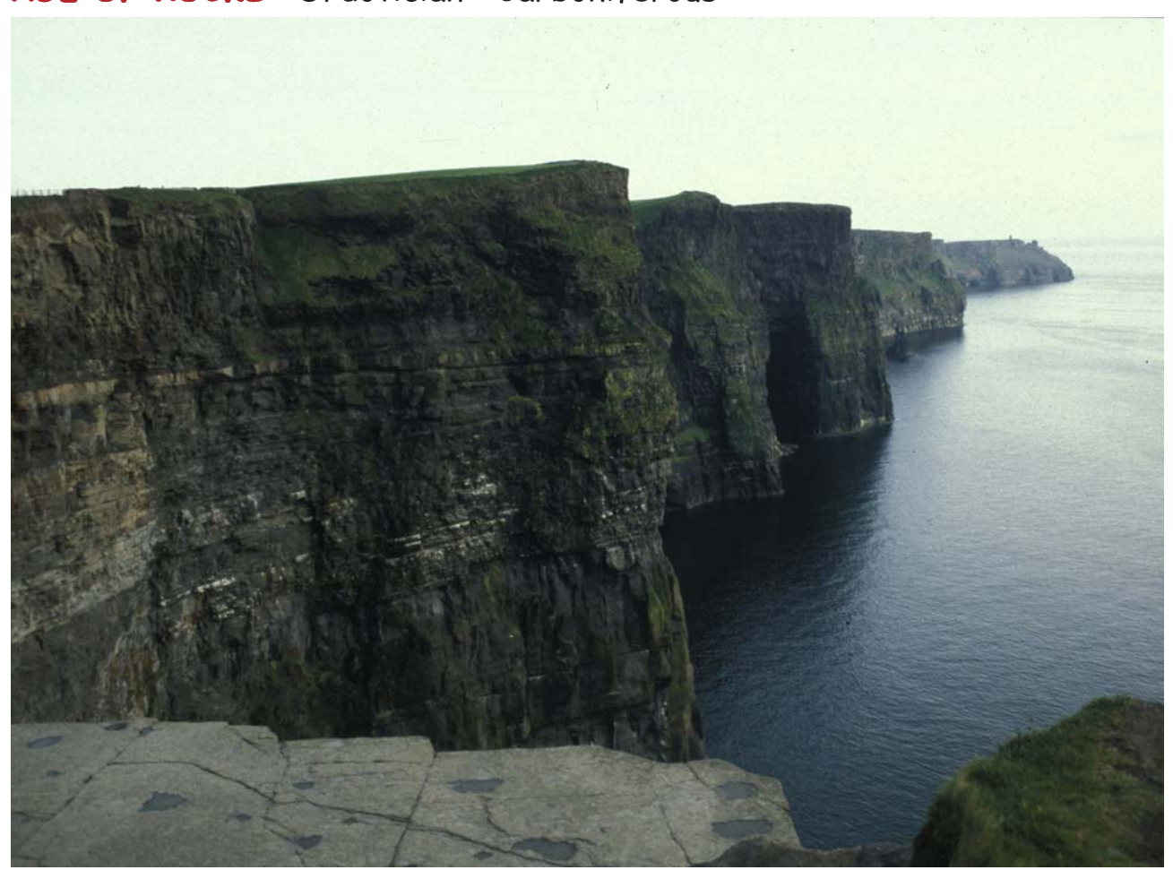
Upper Carboniferous sandstones and shales, Cliffs of Moher

AGE OF ROCKS: Ordovician - Carboniferous