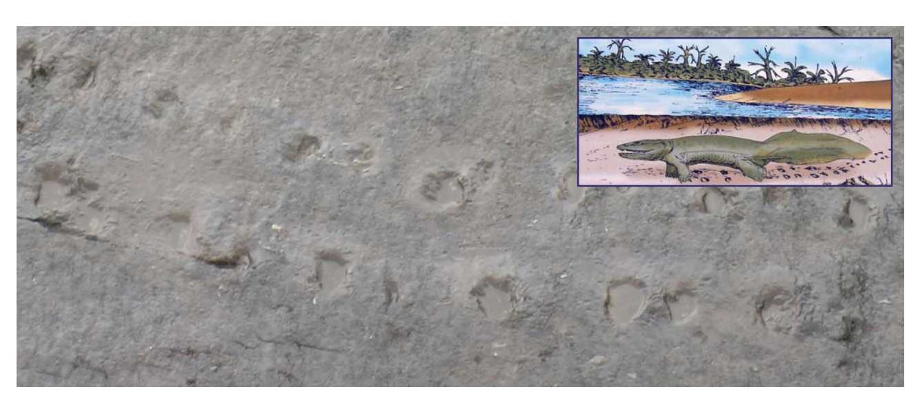
Trackway made by a tetrapod (inset) at Valentia Island