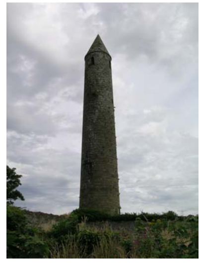
Rattoo Round Tower

Various rock types have been used for building. Devonian Old Red Sandstone was used to build Staige Fort near Sneem and Rattoo Round Tower in north