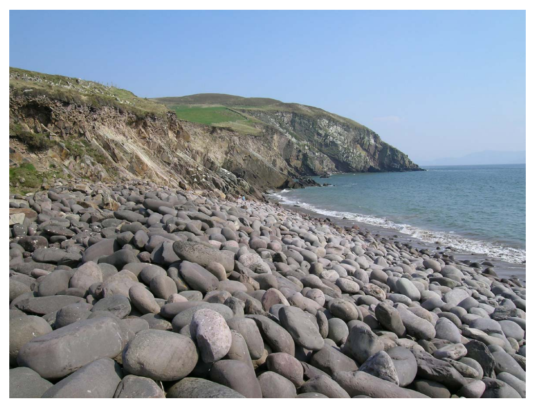
Storm Beach at Kilmurry Bay, Dingle Peninsula

AGE OF ROCKS: Ordovician to Carboniferous; Cretaceous