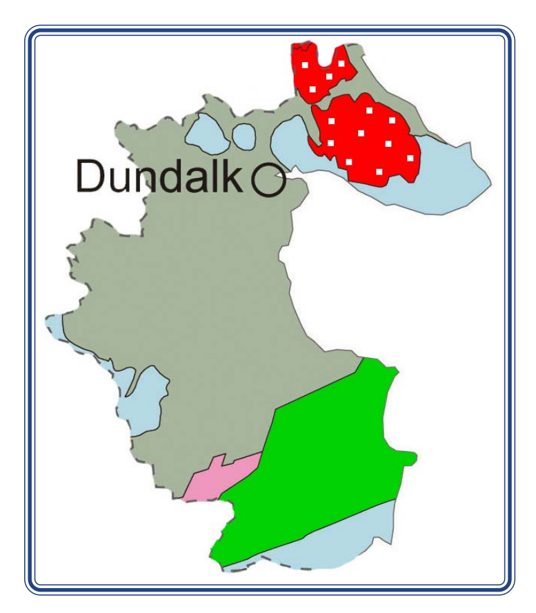
Geological Map of County Louth

Pink: Ordovician; Green: Silurian; Grey: Ordovician & Silurian sediments; Red: Granite; Light blue: Lower Carboniferous limestone; Flecked Red: Paleogene Gabbros and other intrusive rocks.