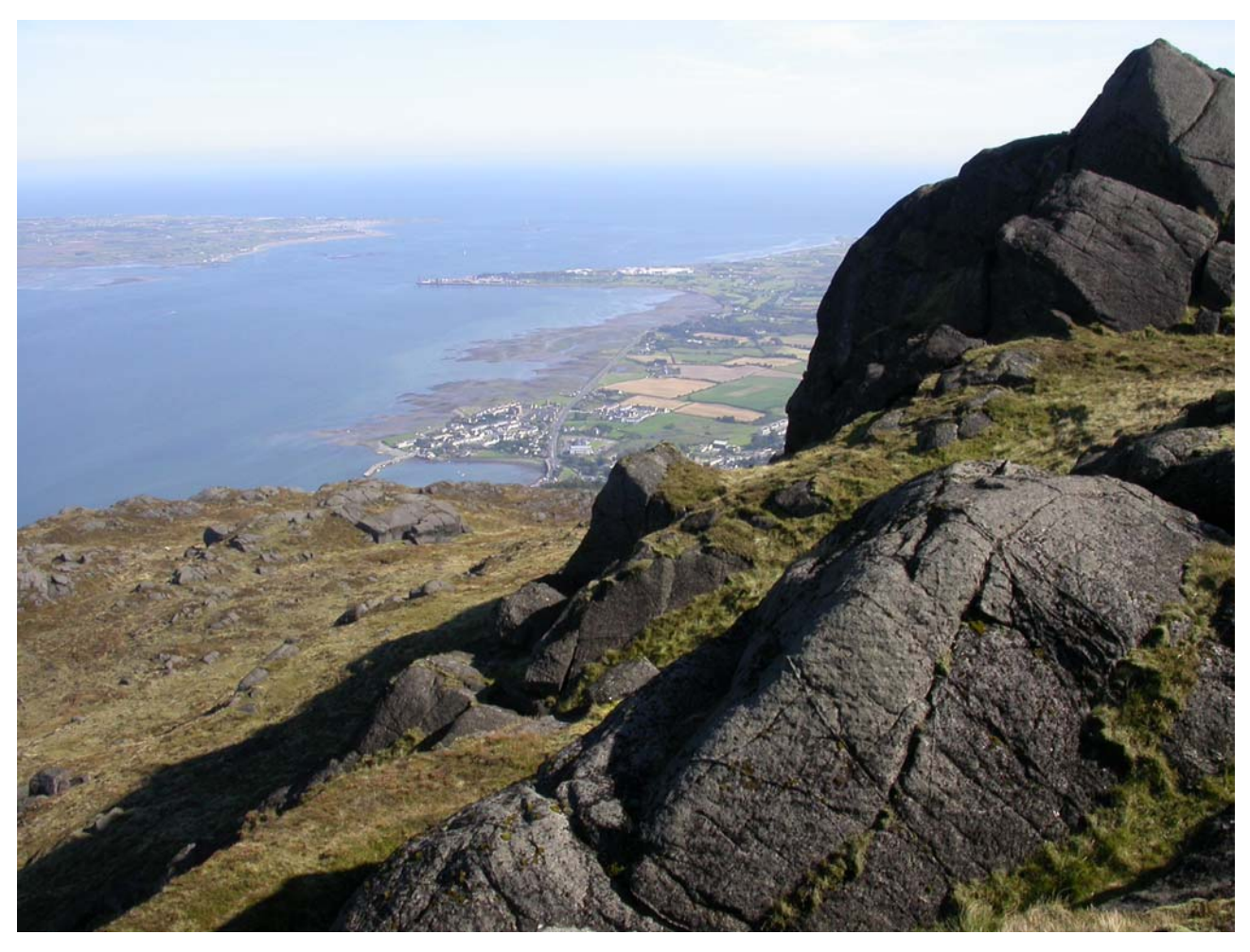
Slieve Foye rises dramatically above the town of Carlingford. The dark gabbros of which it is made cooled slowly, producing large crystals, in the magma chamber below a volcano.

Glacial till, or 'boulder clay', forms some of the rapidly eroding coastal cliffs, particularly at Dunany Point on the south side of Dundalk Bay.